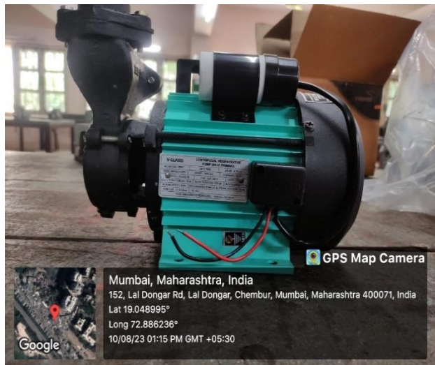
Figure 4: Monoblock Pump