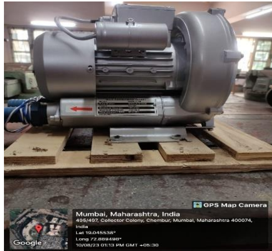
Figure 3: 0.5 Hp Blower