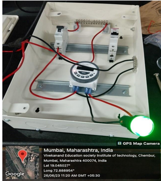
Figure 1: Control panel with automatic and manual modes