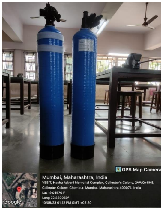
Figure 2: Sand and carbon filter